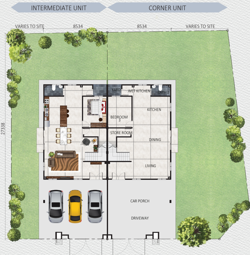
Ground Floor 底楼